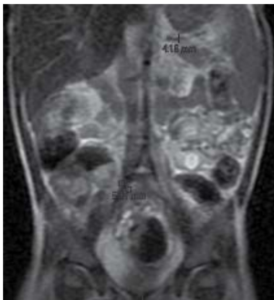
Figure 1. Magnetic resonance angiography.

with platelet count of 75 000/mm 3 . The splenic vein measured 4 millimeters. Iliac-mesenteric-caval shunting was performed with a 7 mm anastomosis. (Figure 2)