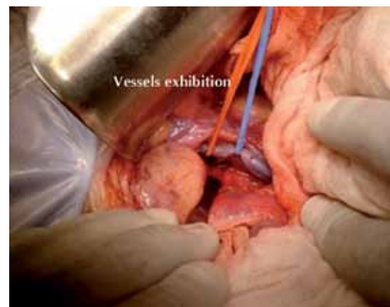
Figure 2. Iliac-mesenteric-caval shunt.

The patient received enoxaparin for five days and then was changed to acetylsalicylic acid. A postoperative ultrasound showed adequate and permeable bypass; spleen size 7 × 2.7 cm. A control endoscopy before discharge found G1 varices; platelet count: 168 000/mm 3 (Tables 3 and 4).