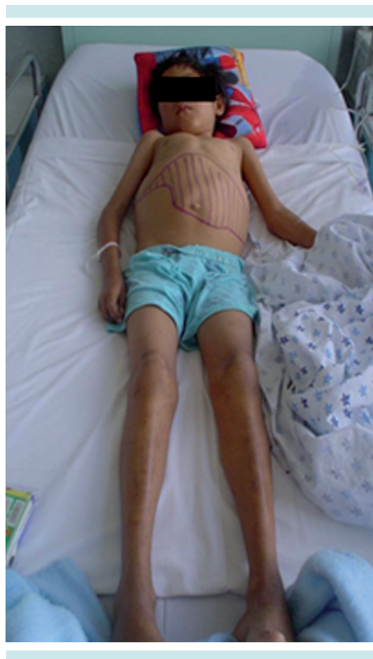
Figure 1. Patient with NPD-B showing hepatosplenomegaly.

transaminases and only one had elevation of bilirubins. Detention of weight and height was observed. Thrombocytopenia was found in the three patients, and in two anemia, leukopenia, and prolonged clotting time (Table 1). There was pulmonary compromise in two subjects, without significant clinical manifestations. Chest x-rays showed a diffuse micronodular infiltrate in both cases. (Figure 2) In two patients there were neurological alterations, characterized by mild psychomotor retardation. One patient had heart involvement, identified by echocardiogram: right ventricular dilation, with FEV1 of 74%. Ophthalmological examination observed